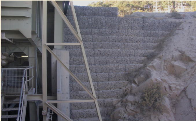
10 years after completion in 2005.