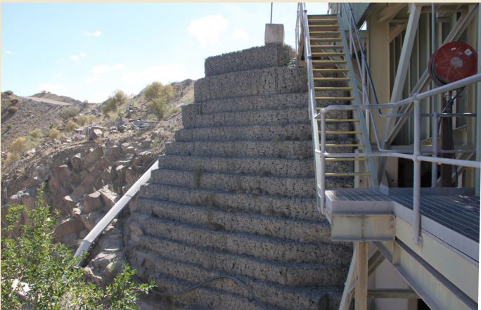
24 years after completion in April 2019.

Another site visit was conducted in March 2019 and once again, the client reiterated how happy they were with the performance of the Terramesh walls.