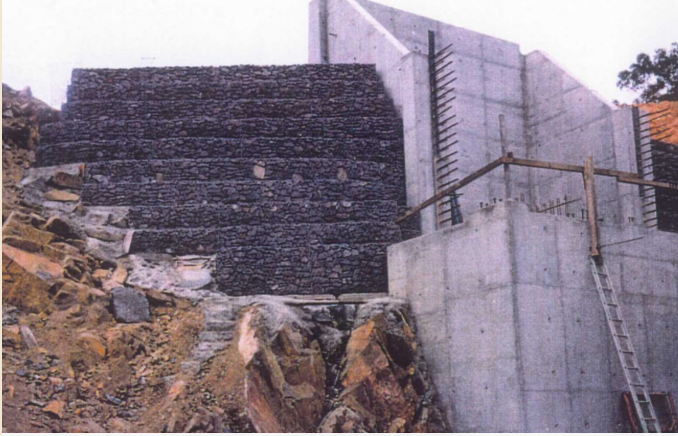
During construction in 1995.