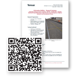
Tensar InterAx Success Stories