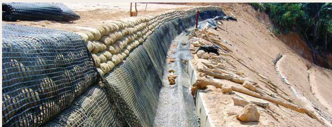
Miragrid® GX geogrids being wrapped around stacked geobags to construct a wall.

This facing system is suitable for slopes with angles up to 80° and heights varying from 3m to 50m. Ground water seepage is controlled by installing a geosynthetic wrapped stone drainage layer at the rear of the reinforced soil structure with the ground water discharged through drainage pipes into surface drains. The completed structure, when vegetated, blends easily with the surrounding environment. It is a proven and cost effective alternative to conventional concrete structures.