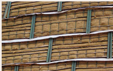
Front of a steep slope with steel mesh formwork facing nearing completion.