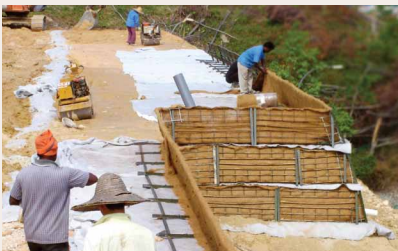
Steel mesh formwork being set-up above layers of Polyfelt® PEC geotextiles.

TenCate Polyfelt® PEC is most commonly used as the reinforcement when the soil mass consists of finer-grained backfill that has poor drainage properties. Alternatively, TenCate Miragrid® GX geogrid is typically used to reinforce coarser-grained soil backfills. This system is ideal for slopes with angles up to 80° and heights ranging from 2m to 25m. It provides a stable facing that blends with the surrounding landscape.